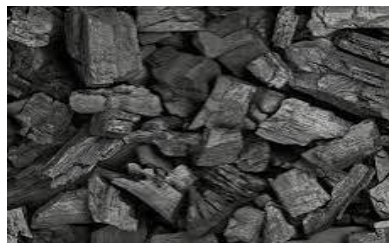
Fig. 2 Charcoal