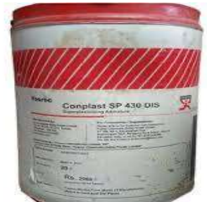
Figure: 4 Conplast SP430 from FOSROC brand

Non-toxic conplast- SP430 PQC, a concrete superplasticizer based on Sulphonated Naphthalene Polymer is used as a water-reducing admixture and to improve the workability of admixed concrete as shown in Figure. Conplast SP430A1 (QCDA-579) has been specially formulated to give high water reductions up to 25% without loss of workability or to produce high quality concrete of reduced permeability. Specific gravity of superplasticizer is 1.23 as reported by manufacturer.