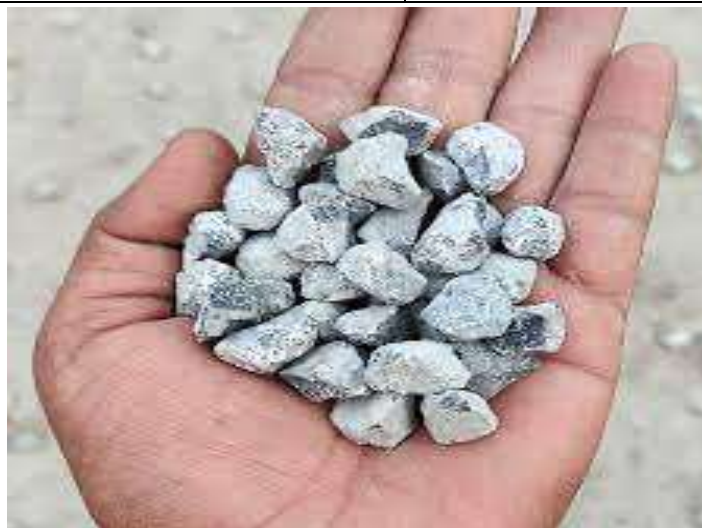
Figure:3 Locally available coarse aggregate of 10 mm size