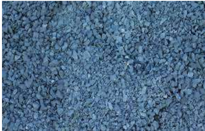
Figure: 2 Locally available fine aggregate