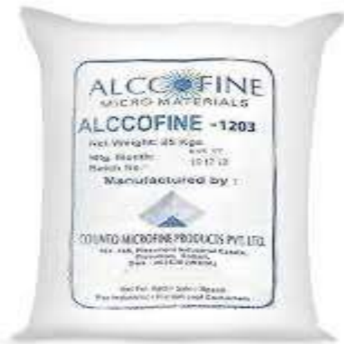
Figure:1 Alccofine from Ambuja Cement