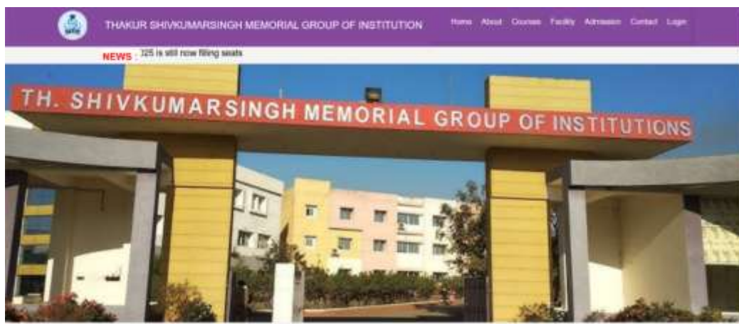
Fig.1 Home Page I of Our Website