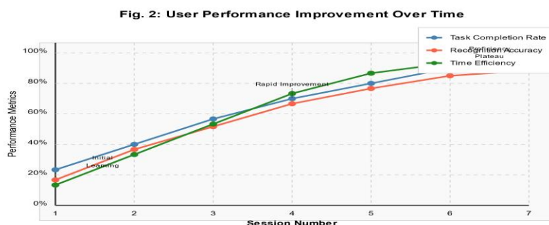
Fig. 2 illustrates user performance improvement over time during the study, showing rapid adaptation to the gesture-based interface.

78% of the participants found the gesture interface more convenient to use than traditional calculators for rapid calculations