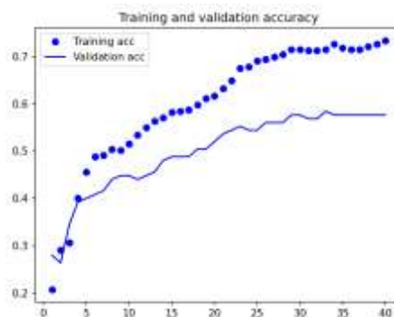
Figure 4. Accuracy for Three class classification