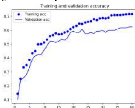
Figure 5. Accuracy for Two class classification

The five-class classification—a more nuanced task potentially including additional subtypes of seizure activity or intricate brain states—exhibited a greater range of performances in the deep learning model, with accuracies between 99.25% and as low as 53%, varying according to class and complexity of dataset. Even at the lower end, this range overlaps with or surpasses the 60–70% accuracy range of other models, suggesting that although difficulty rises with classification complexity, the deep learning model can still be competitive and often superior to traditional methods.