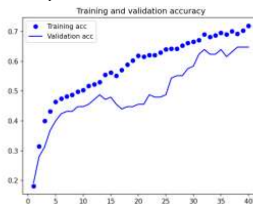
Figure 3. Accuracy for five class classification

Even for the three-class classification problem in which EEG signals could be separated into seizure, interictal (inter-ictal i.e., the period between the seizures), and normal phases, the deep model had a greatly high accuracy level of 99.75% once again being higher than 88% given by traditional models. This reaffirms the quality of the model in processing subtler differences within EEG patterns.