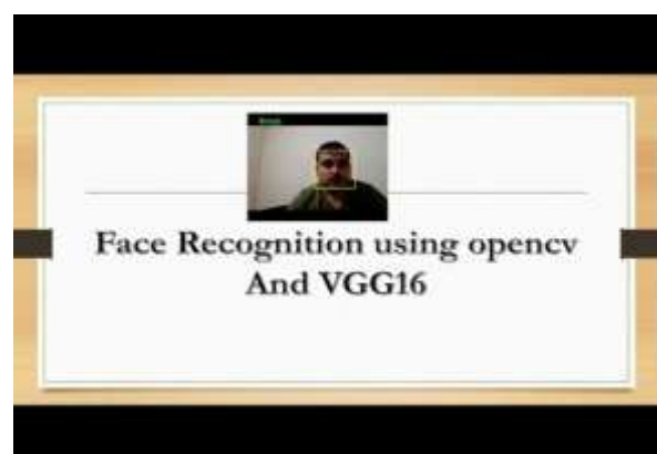
Figure 3: Result