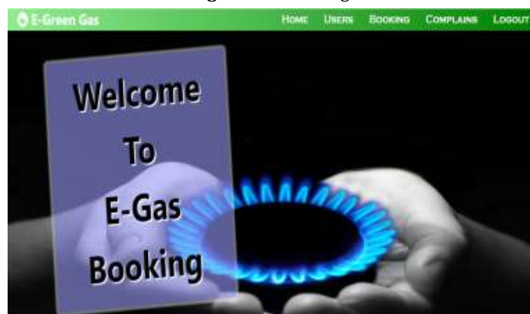
Figure 3: Dashboard