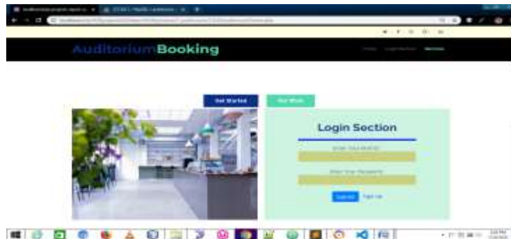
Figure 2: Authentication Page

The Online Auditorium Booking System is a comprehensive platform designed to simplify the process of reserving, managing, and hosting virtual events in virtual auditoriums. It provides event organizers with a user-friendly interface to browse available auditoriums, book them for specific dates and times, and customize the virtual environment to suit their event requirements. The system ensures a seamless and engaging event experience for participants by The Online Auditorium Booking System streamlines the process of reserving virtual auditoriums, facilitating seamless event management and providing a captivating virtual experience for participants. By integrating essential features, customization options, and security measures, the system aims to meet the needs of event organizers, enhance participant engagement, and ensure the success of virtual events incorporating features such as live streaming, interactive tools, and multilingual support.