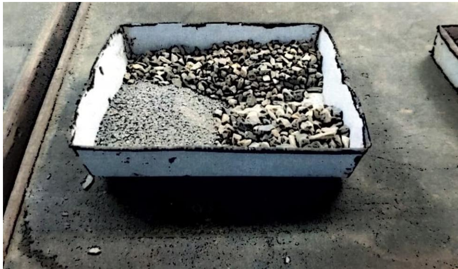
Fig. 1 Aggregates and Filler used for testing

The required properties of aggregates depend upon the type of pavement construction, traffic and climatic conditions. All the above-mentioned properties need not necessarily be possessed for a particular construction.