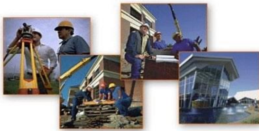
Fig.2 project planning:

g) Coordinating: It involves bringing together and coordinating the work of various departments and sections so as to have good communication. It is necessary for each section to aware of its role and the assistance to be expected from others.