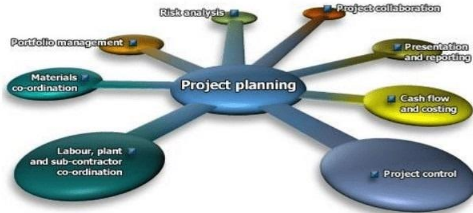
Fig.1 Importance of construction project planning:

It is the process of selecting a particular method and the order of work to be adopted for a project from all the possible ways and sequences in which it could be done. It essentially covers the aspects of 'What to do' and 'How to do it'.