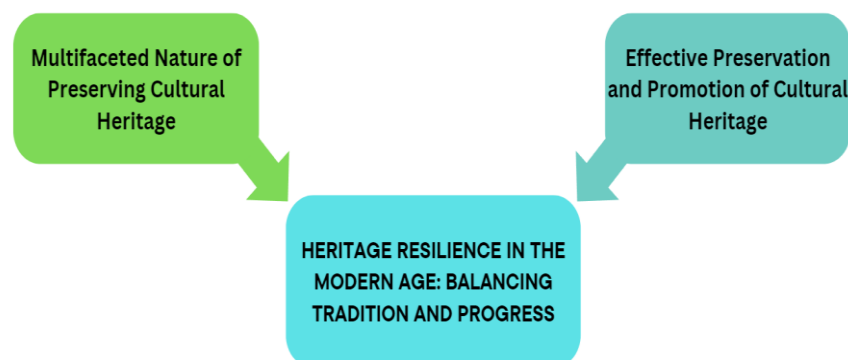
Figure 2. Factors of Heritage Resilience in the Modern Age: Balancing Tradition and Progress