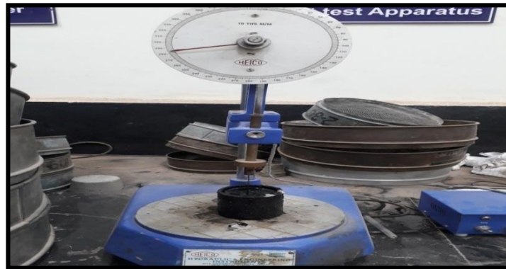
Figure 3 Penetration test