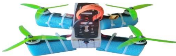
Fig. 2. Top view of the UAV