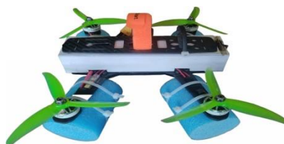
Fig. 3. Side view of the UAV

sensor, ESP32 Camera Module, ESP-8266 D1 Mini Board are placed. At the top we can see the battery strip at which we can place the CNHL 1200mAh 100cc 4s Lipo Battery is placed. The 4 Genmfan Vanover 5-inch propellers are also visible placed at the 4 ends of the QAV 250 4mm Carbon Fiber frame. The figure 4 shows the output readings of the BME680 sensor. The sensor has the ability to find out various environmental parameters including the temperature, VOC, Air quality, Pressure and Humidity. It shows the reading of each parameter in its SI unit. The temperature is calculated in the °C unit. The human body has an “upper critical temperature” which it can tolerate safely of between 40 and 50 degrees Celsius. The sensor has the ability to measure the temperature from 0-100°C. The air quality is calculated using the unit ppm (Parts Per Million). It can measure up to 1000 ppm. The VOC is also measured in ppm up to a maximum of 1000 ppm. The pressure is calculated in hPa (Hectopascal) upto a maximum of 1000 hPa. A person can withstand perhaps 100 hPa. The Carbon Dioxide is measured in the ppm (Parts Per Million) upto a maximum of 1023 ppm. The figure 5 shows the output of