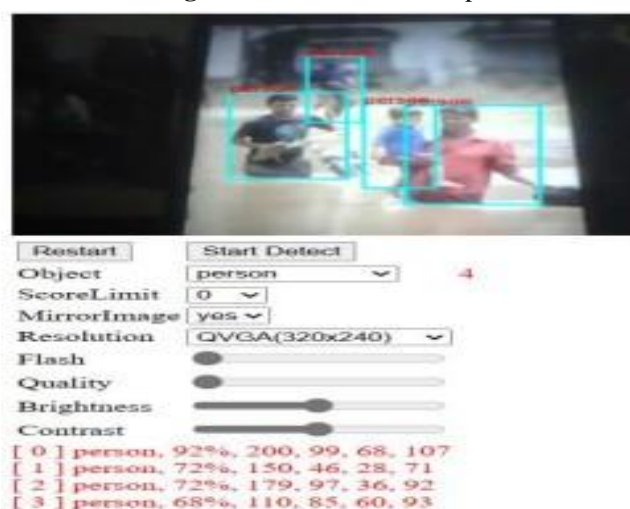
Fig. 5. ESP Cam module output