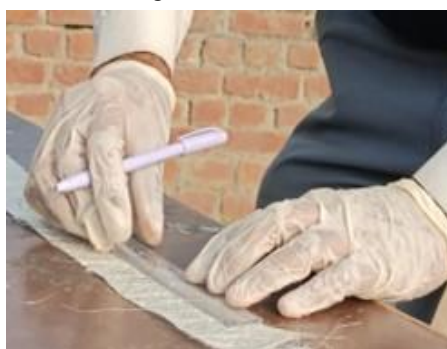
Figure 2 Fabrication of GFRP

The fiberglass in mat form was laid out along the mold surface. Subsequently, a precise quantity of epoxy resin was dispensed into a container, mixed with a 1:10 ratio of hardener. Once thoroughly blended, the epoxy resin and hardener mixture was evenly spread across the surface of the glass fiber.