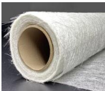
Figure 1 Fiber Glass Matt form

To solidify the epoxy resin and the glass fiber mat structure, "HY951," an epoxy curing agent from Araldite, was employed. Curing involves the hardening and toughening of polymers through the cross-linking of chemical chains, ensuring robust bonding between the components. The efficacy of curing depends significantly on the proper selection and application of the hardener, including its distribution, curing time, and the ratio used. Maintaining uniform resin distribution and controlling temperature and pressure are critical parameters during the curing process (SPRINGER, 1983). In this study, the epoxy resin and hardener were mixed in a ratio of 10:1 to ensure optimal curing conditions. This precise formulation and controlled curing process are essential for achieving the desired mechanical properties and structural integrity of the composite material.