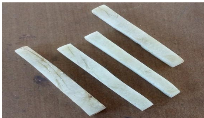
Fig. 3 Prepared Specimen

fiberglass sheet is then laid down, and the epoxy mixture is rolled over it once more. This procedure is repeated until the desired thickness is reached.