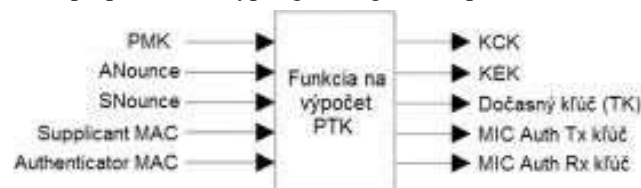
Fig.no.2-Process function to calculate PTK value

Due to this fact, attacks using statistical analysis like in the case of WEP are impossible. The process of authentication and dynamic encryption key generation is called 4-way handshake. It is therefore a kind of 4-step exchange of messages between the access point and the client. The dynamic key generation process starts with connecting the device to the network. After attempting association and authentication, devices must generate a Pre-Shared Key (PSK). This process takes place on the basis of the entered user password and the ESSID (name) of the network, which are processed in a special hash function. The result of the operation is a 256-bit string - PSK, also called PMK (Pair wise Master Key). After the PSK is generated, the access point itself initiates the 4-stage exchange, which generates a pseudo-random value (ANonce) and sends it to the client. After receiving a message with this value, the client will generate its own pseudo-random value (SNonce). With the help of MAC addresses of devices, pseudo-random values and PMK, a PTK value is subsequently generated, which will be used in future communication for the purpose of encrypting messages. This process is shown in Figure no.2.