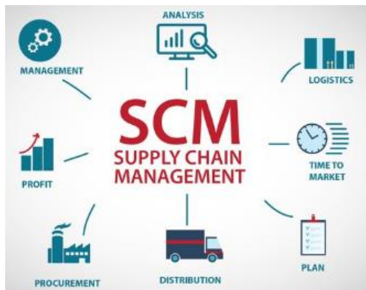
Fig:1 Supply Chain Management

Data science, through the application of machine learning, predictive analytics, and big data technologies, significantly enhances the accuracy, efficiency, and responsiveness of SCM. By leveraging these advanced techniques, businesses can better navigate the intricacies of supply chains, turning vast and complex datasets into actionable insights. These insights not only refine traditional decision-making processes but also provide a new level of understanding that enables more effective and informed decisions.