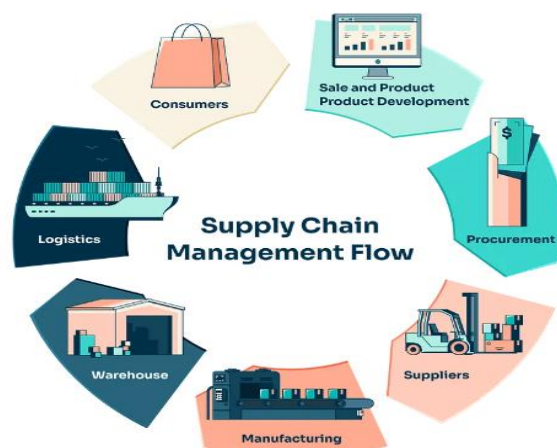
Fig: 2 Flow of Supply Chain Management

This study employs a qualitative research design, with a primary focus on conducting a systematic literature review to explore the applications of data science in Supply Chain Management (SCM). The qualitative approach is selected due to its effectiveness in comprehensively exploring and understanding the theories and models related to data science and its integration into SCM decision-making processes.