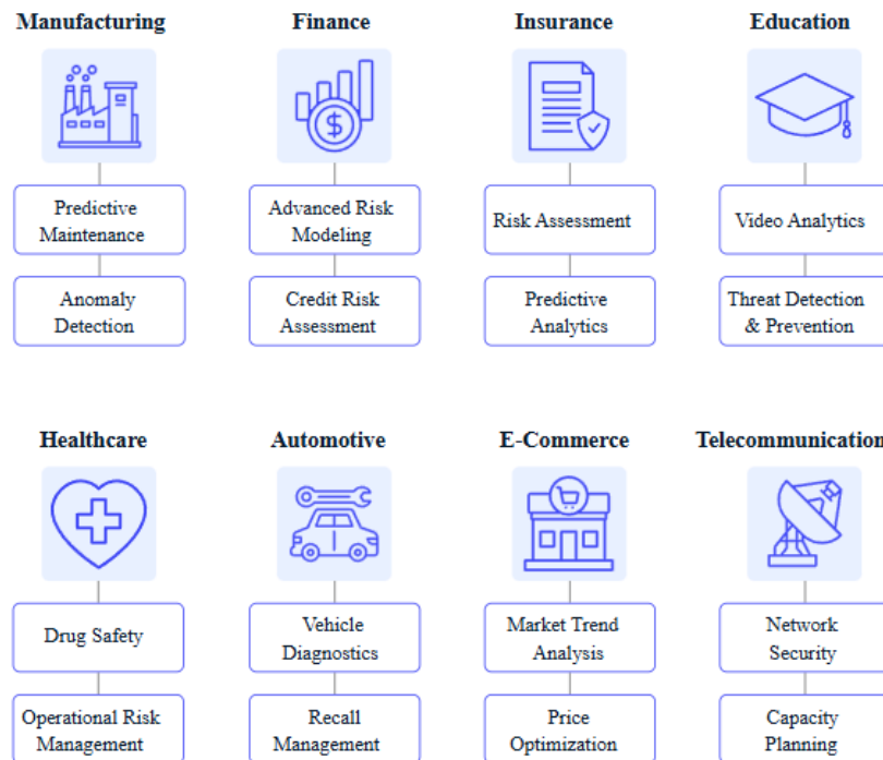
Fig 2: Applications of AI in risk management across industries

The study concludes with an exploration of future directions and emerging challenges in the field of AI. This section draws on speculative analysis and expert insights to forecast the potential impact of quantum AI, neuromorphic computing, and evolving regulatory landscapes on enterprise AI adoption. The research also considers the long-term implications of these technologies for risk management, ethics, and global AI governance.