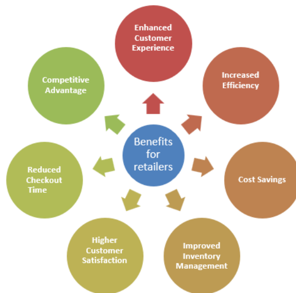
Figure 2 Benefits Of Technology For Retailers

for employees to handle transactions, which free them up to concentrate on other elements of providing customer care[69]. Through the use of real-time tracking and data analytics, this technology has the potential to improve inventory management capabilities from an operational perspective. By gaining useful insights about the tastes and purchase behaviors of their customers, retailers are able to alter their stock levels and more effectively personalize their marketing efforts without sacrificing effectiveness[70]. The reduction in checkout infrastructure and associated expenditures (such as cash registers and their upkeep) can contribute to significant cost reductions[71]. Checkout infrastructure includes things like cash registers. Additionally, the seamless experience that is given by Just Walk Out technology has the potential to improve customer satisfaction and loyalty, which may result in an increase in repeat business as well as the attraction of new customers who acknowledge the convenience and effectiveness of the technology. Overall, this technology exemplifies a forward-thinking approach to retail that is in line with the growing need from customers for shopping experiences that are uncomplicated and hassle-free[72, 73].