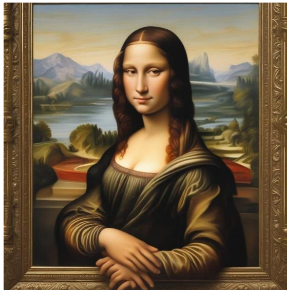
Da Vinci's Mona Lisa

Moreover, the Renaissance saw the emergence of new artistic techniques, such as linear perspective and chiaroscuro, which allowed artists to create more realistic and three-dimensional representations. The use of oil paints also became prevalent, enabling artists to achieve greater depth and vibrancy in their works. This artistic revolution was not confined to painting; it extended to literature and architecture, with writers like Dante Alighieri and Petrarch exploring human experiences and emotions in their works.