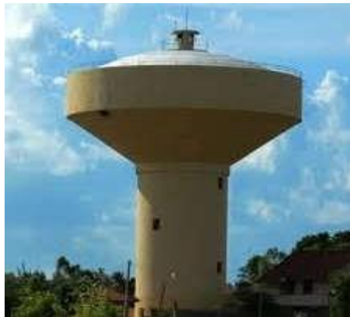
Fig: 1.1 Intze Water Tank

The design of elevated water tanks must take into account various seismic load combinations to prevent failure or collapse during an earthquake. One of the key factors influencing the seismic resilience of these tanks is the type of bracing system employed in the supporting structure. This research aims to compare the seismic performance of circular elevated water tanks with different bracing systems in seismic Zones II and III on soft soil.